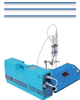
RA-915M with RP-92