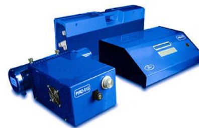
RA-915M with PYRO-915+