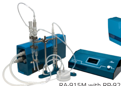
RA-915M with RP-92