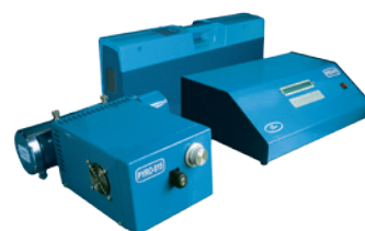
RA-915M with PYRO-915+